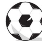
la educación física