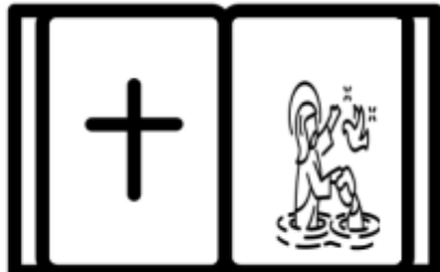
Being welcomed into the Christian Church