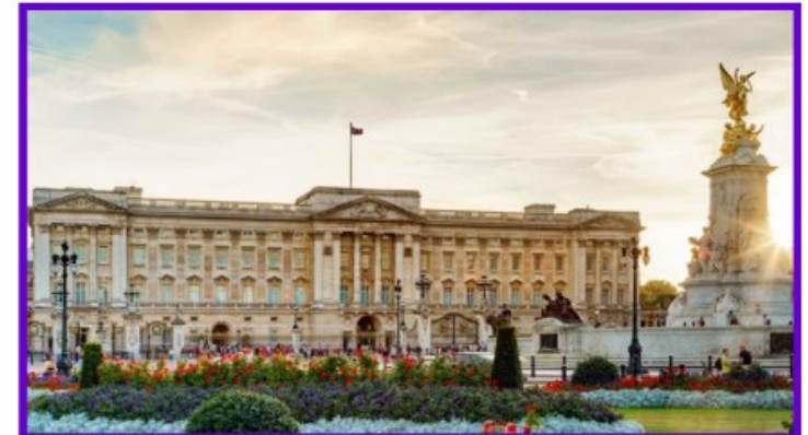
Buckingham Palace - The Palace where the monarch of the United Kingdom lives when they are in London.