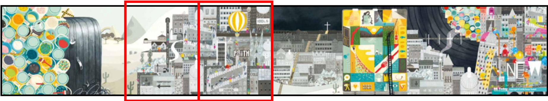
People of God