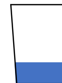
one quarter full