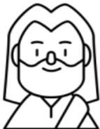
Fishers of Men