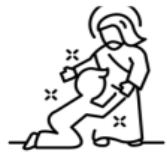
Man with leprosy