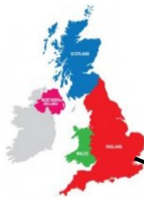
This is the United Kingdom (UK), where we live. The UK is part of Europe.